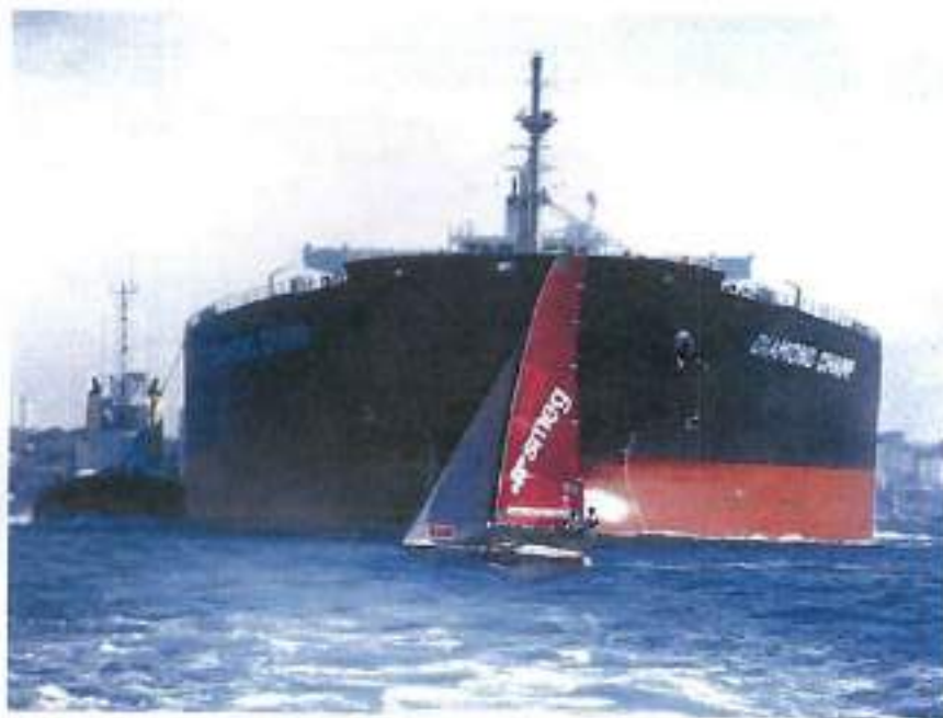
Where's Terry with Naval Numeral Zero when you need him?